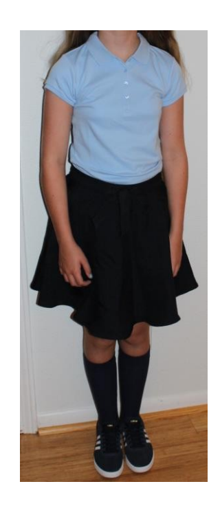
<u>Upper School Formal Days: M/T/W/TH/Field Trips</u>